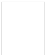
ALUMINIUM RAIL KX-3000 3M RAL9005 (1PC)