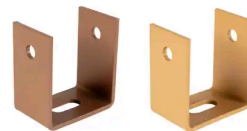
ALU U-BRACKET (16 PCS)