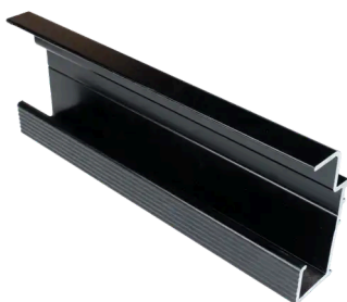
ALUMINIUM RAIL KX-3000 3M (1PC)