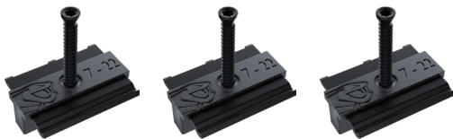
4,2 × 27mm (S) 4,2 × 35mm (M) 4,8 × 43mm (L)