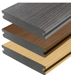
HARMONY DECKING 22,5X138MM