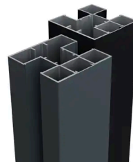
BOSTON - ALUMINIUM POST 75X75MM