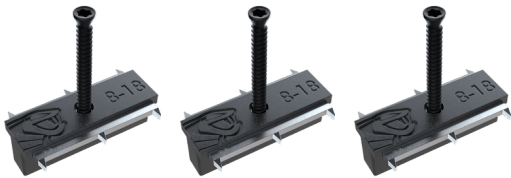
4,2 × 27mm (S) 4,2 × 35mm (M) 4,8 × 43mm (L)